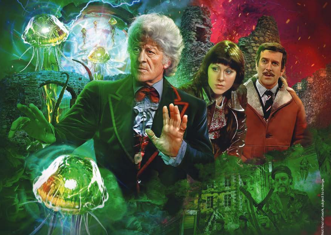
No final artwork, subject to change