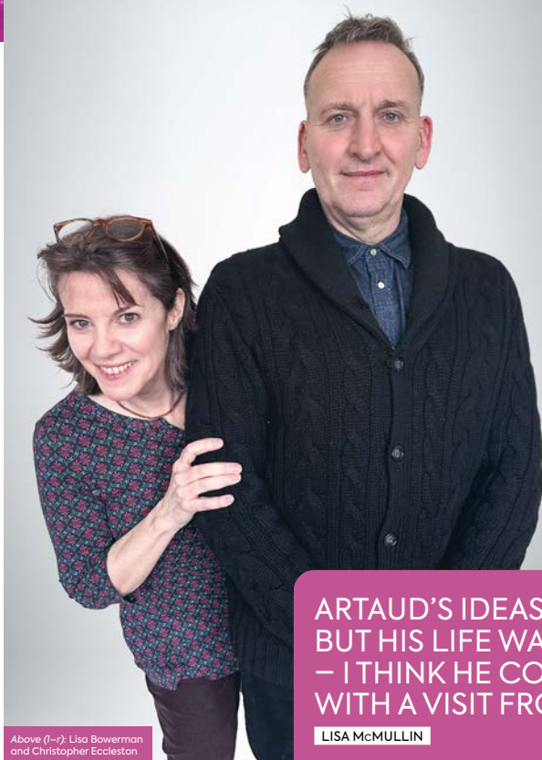
Above (l-r): Lisa Bowerman and Christopher Eccleston