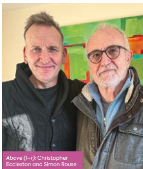
Above (l-r): Christopher Eccleston and Simon Rouse