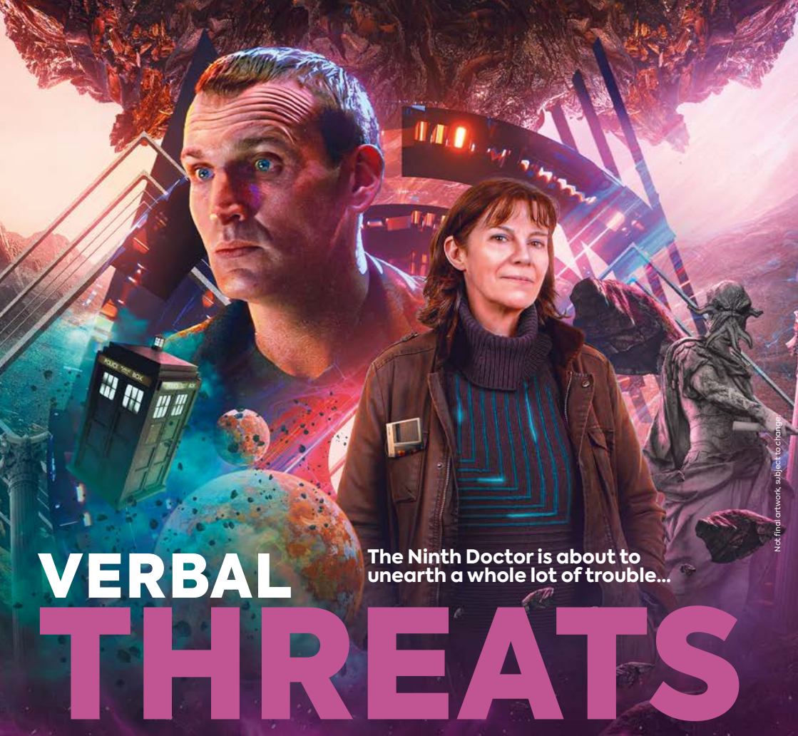
Not final artwork, subject to change